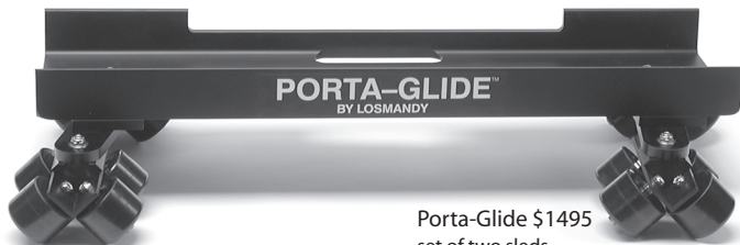
Porta-Glide $1495 set of two sleds